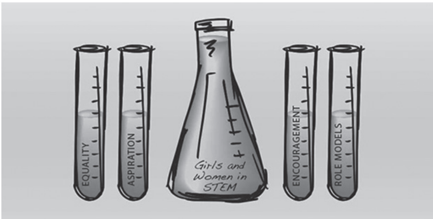
Figure 2: How can we get more girls and women into STEM?

This is not to suggest that these factors are irreversible and the greater engagement of women in STEM study and occupation is somehow out of reach. On the contrary, the identification of these multivariate factors allows one to critically assess how their impacts may be carefully unwound. The following provides a summary of the key recommendations governments and policymakers of Asia may consider in addressing this important shortage: