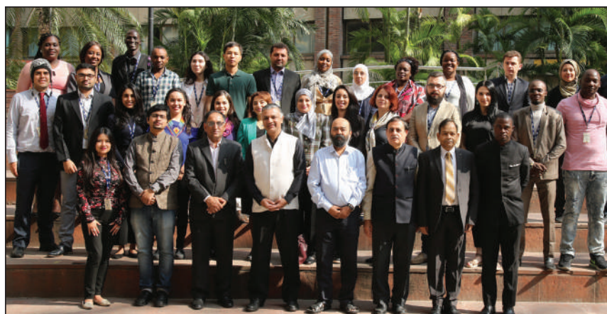
Participants of the ITEC Capacity Building Programme on Learning South South Cooperation with RIS faculty members.