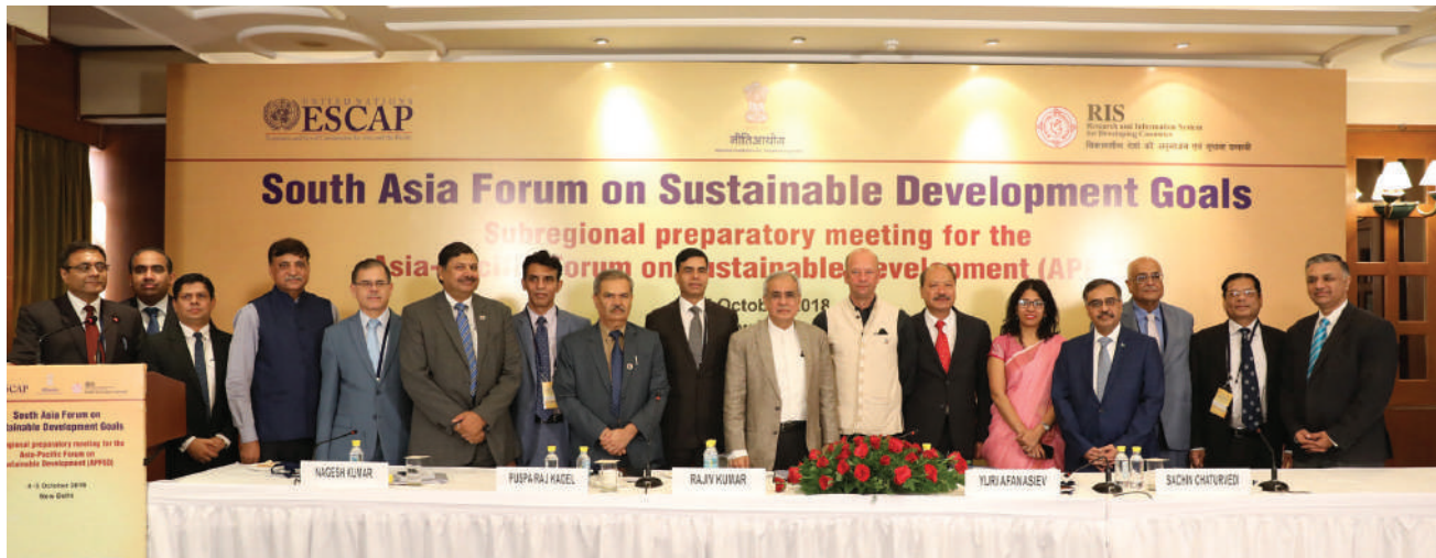
Distinguished panelists during the deliberations of the South Asia Forum on SDGs.

RIS in partnership with the UNESCAP and NITI Aayog organised the South Asia Forum on Sustainable Development Goals - Subregional preparatory meeting for the Asia-Pacific Forum on Sustainable Development (APFSD) on 4-5 October 2018 at New Delhi.