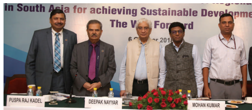
Lead participants at the Policy Dialogue.

RIS in partnership with the UNESCAP and South Asia Centre for Policy Studies (SACEPS) organised Policy Dialogue on Unlocking the Potential of Regional Cooperation in South Asia for achieving Sustainable Development Goals: The Way Forward on 6 October 2018 at New Delhi.